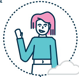
People who can't afford a large payment