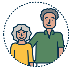
Homeowners looking for more affordable refinancing options