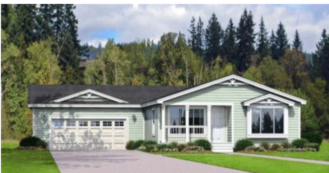
Rendering of a Comparable Renew Now Home