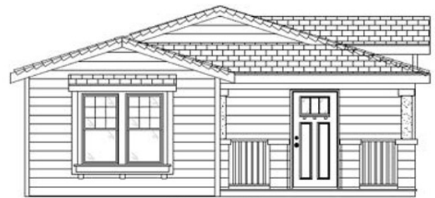
Front Elevation 4/12 Roof Pitch